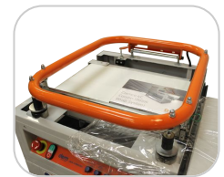
Tubular 1.5" diameter heavy duty seal bar